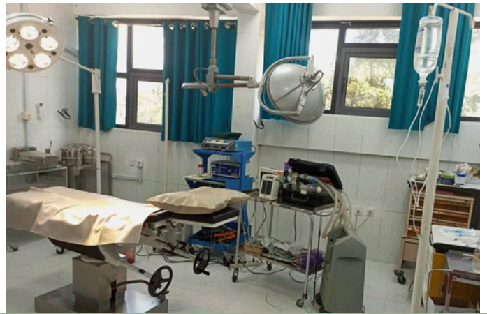
Refurbished operating theatre at St Blaise hospital

Future projects currently going through the assessment and approval process include: