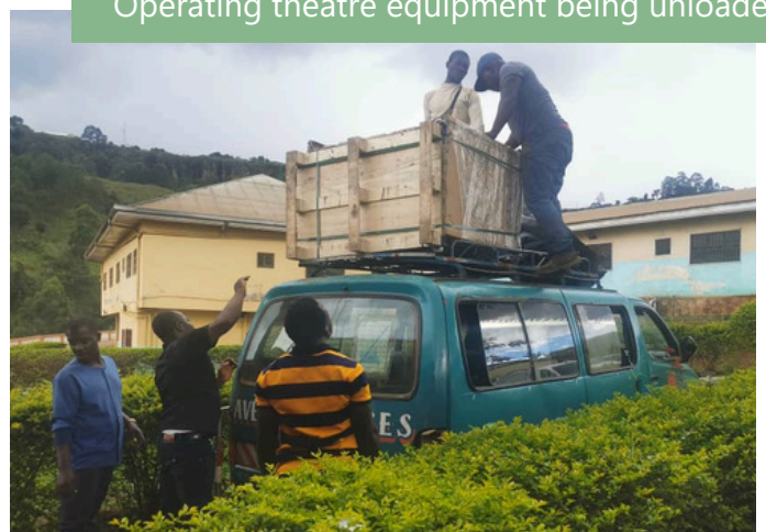
Operating theatre equipment being unloaded

The Portsmouth Bamenda Committee (the PBC) was established to oversee the delivery of projects funded by money raised in our Diocese. Every penny donated is used to support projects and develop and strengthen the special relationship with the Archdiocese of Bamenda.