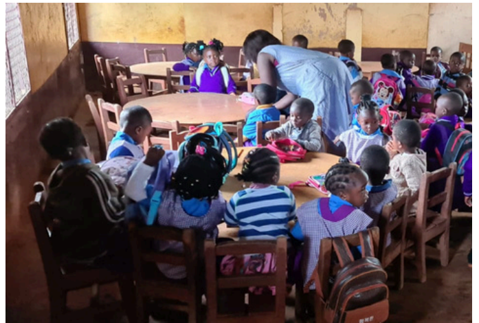
St Felix Nursery School - demonstrating urgent need for new facilities'